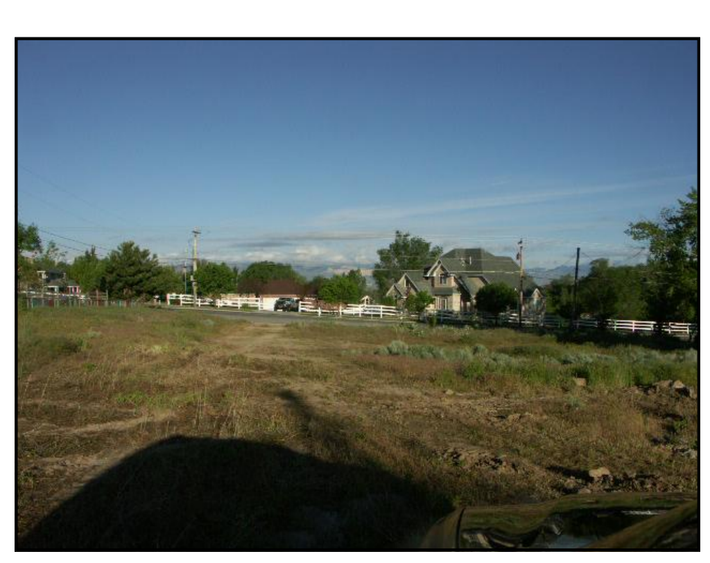
Form PIC4x6.SR — "WinTOTAL" appraisal software by a la mode, inc. — 1-800-ALAMODE